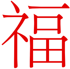
The Chinese character for happiness and blessing.

Intimacy with God brought the greatest happiness to man. The loss of his closeness with God became the greatest curse.