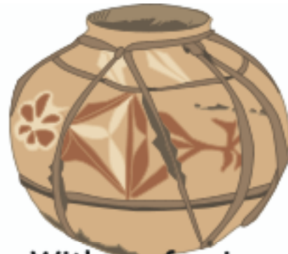
With confession, healing and unity come.

God's greater purpose is to bond us together to work together as one with Him. If confession is not properly carried out, then what could be mended stays shattered bringing disappointment and loneliness to all. God's beautiful designs are shown through His commandments. Confession leads to healthy and beautiful community of relationships.