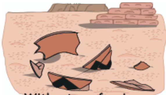
Without confession, brokenness remains.

"And so, as those who have been chosen of God, holy and beloved, put on a heart of compassion, kindness, humility, gentleness and patience; bearing with one another, and forgiving each other, whoever has a complaint against anyone; just as the Lord forgave you, so also should you. And beyond all these things put on love, which is the perfect bond of unity. (Colossians 3:12-14, NASB).